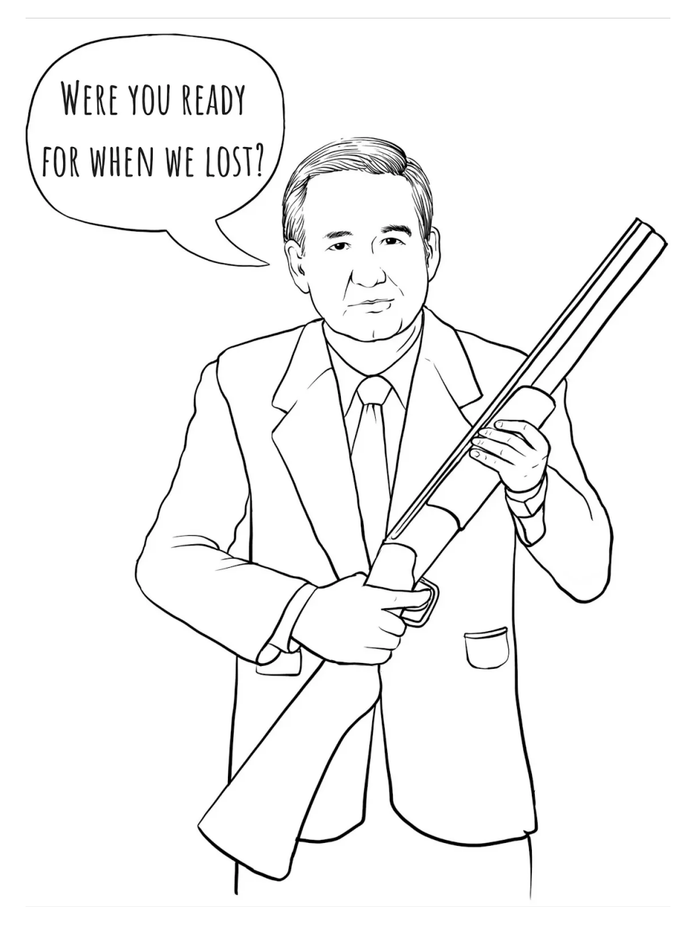
Illustration courtesy of Peter Limberg and Conor Barnes

The new memetic tribes share, to varying degrees, a few characteristics. Most are "unscrupulously optimistic": They see social problems as soluble through large-scale adjustment. They see themselves as spokespeople for larger groups, whether that be "regular people" or "the marginalized." At the same time, they see their existence, or their prime value, as under threat. They do battle both online and off. And crucially, their memetic warfare is just as much about firing up members of their base and creating converts as it is about winning particular battles.