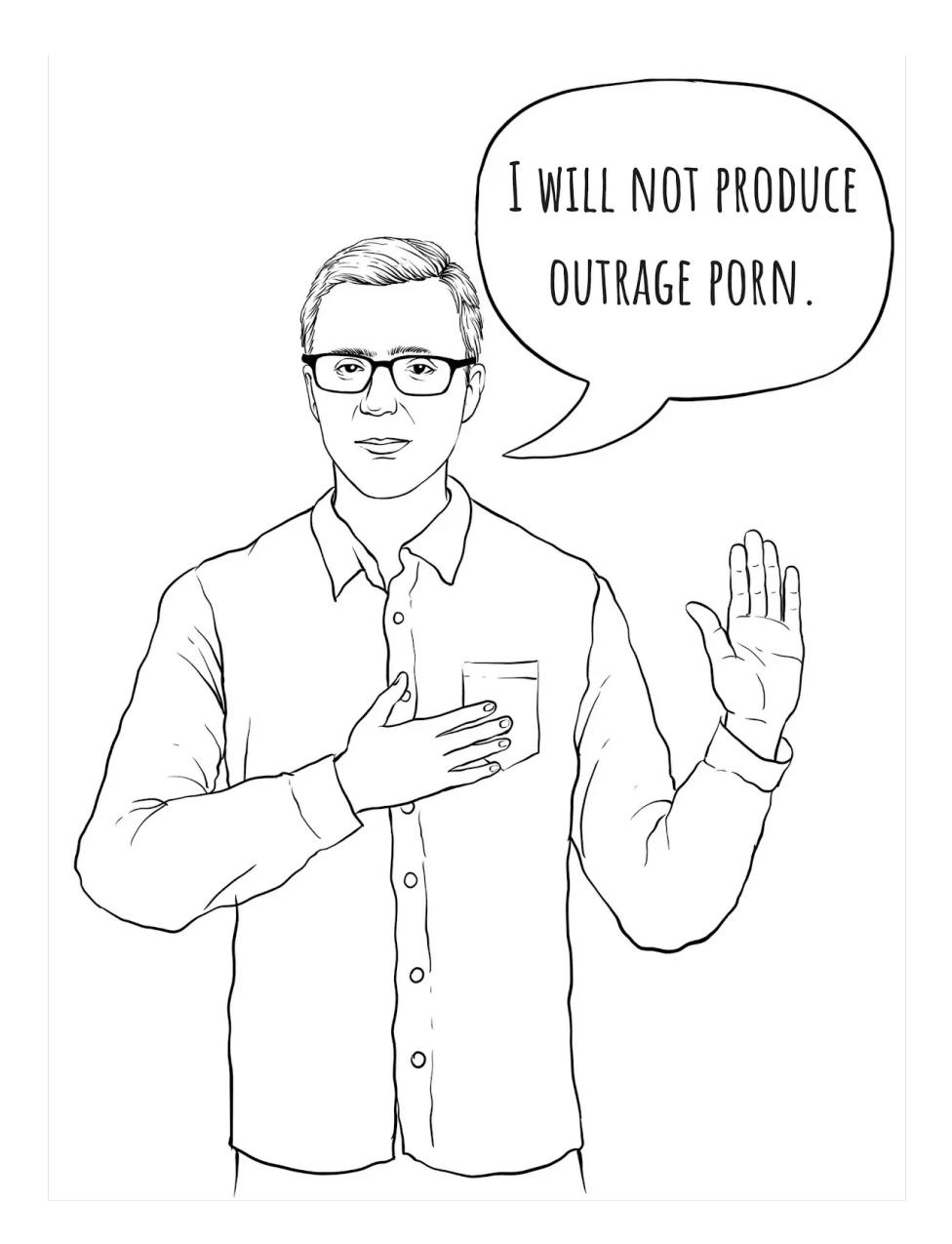
Illustration courtesy of Peter Limberg and Conor Barnes

These eight speculative proposals are meant as a launching pad for discussion. They are not proposals for government or corporate policy. Rather, they are ideas for readers to explore, small but meaningful steps to push against the overwhelming whirlwind of the culture war. It is our hope that interested minds and entrepreneurial spirits will take these proposals and advance them further.